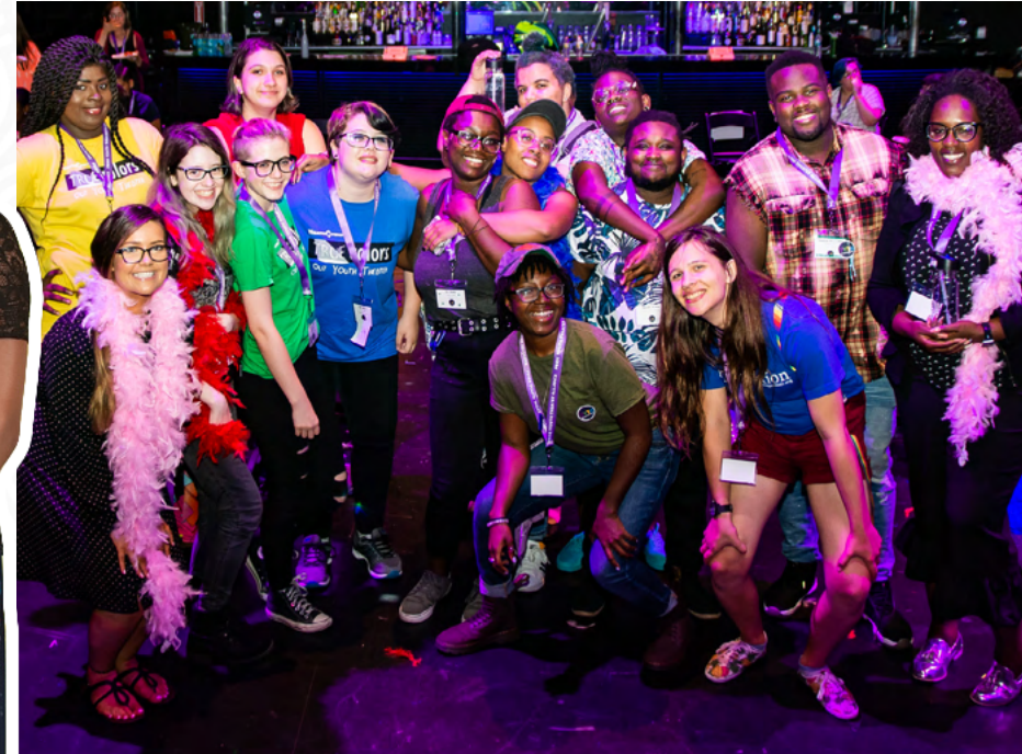
True Colors youth pose at the 2018 Pride Youth Alliance Conference.