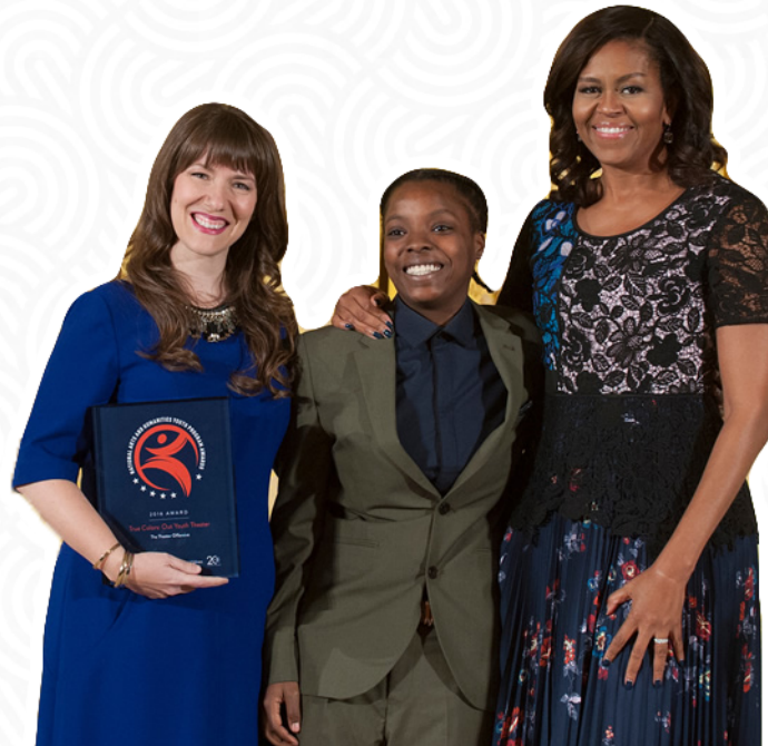
True Colors is presented with the 2016 National Arts and Humanities Youth Program Award by First Lady Michelle Obama.

True Colors: Out Youth Theater is the Theater Offensive's longest running, award-winning program. It houses three ongoing programs all serving the same goal: utilizing community-based theater to train and activate lesbian, gay, bisexual, transgender and allied youth leaders ages 12-25. These subprograms are True Colors Troupe, True Colors Creative Action Crew (CAC), & True Colors Youth Advisory Board.