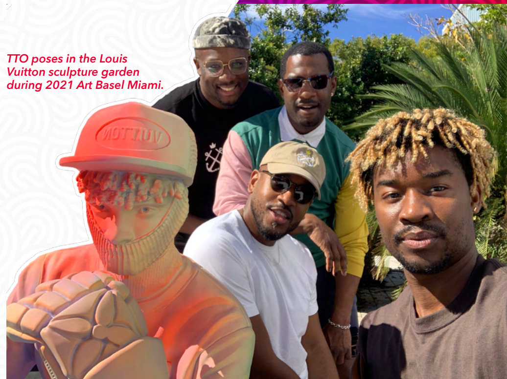
TTO poses in the Louis Vuitton sculpture garden during 2021 Art Basel Miami.

The Theater Offensive (TTO), founded in 1989, is a transmedia social change organization focused on queer and trans POC and their allies, using theatre and the creative process as a cultural organizing tool. Through our organizational values of Design Justice, Shared Power, Youth Leadership, and Experimentation and Innovation, we present liberating art by, for, and about queer and trans people of color that transcends artistic boundaries, celebrates cultural abundance, and dismantles oppression. Since its founding, TTO has grown into a leading presenter of LGBTQ theatre in New England and provided a national model for advocacy and creation of new work by queer and trans artists. Following a staff, board, and community process in 2017, a new 3-year strategic plan was adopted that highlights and furthers TTO's commitment to racial justice and the liberation of queer and trans people of color.